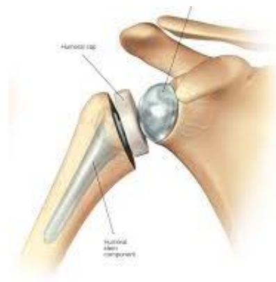
Figure 3. Reverse Shoulder Replacement