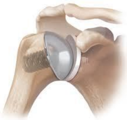
Figure 2. Anatomic Shoulder Replacement

With a reversed total shoulder replacement, the normal structure of the shoulder is “reversed.” The ball portion of the implant is attached to the scapula (where the socket normally is) and the artificial socket is attached to the humeral head (where the ball normally is) (Figure 3). This allows the stronger deltoid muscles of the shoulder to take over much of the work of moving the shoulder, increasing joint stability. A reversed procedure is use for patients with a severely torn and compromised rotator cuff. It is also commonly used in revision surgery cases. It is also becoming more commonly used in some patients with standard glenohumeral arthritis and is now the most common type of replacement.